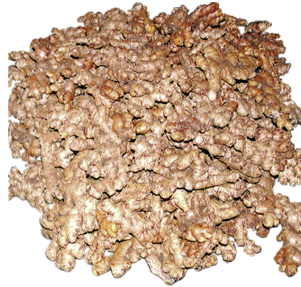
harvested hands of ginger