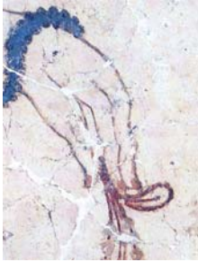
Figure 14: Xeste 3, "Lustral Basin" North Wall: Adorants, (Coumas, 1992)

Proxy evidence has been used in other archaeological disciplines to study transitory aspects of culture. Such techniques are used to study ancient dance. Dance is an important part of culture. Dance cannot be directly observed except during moment of dance. How then can one study dance as it was done in the seventh century BCE? One can examine pottery fragments with depictions of people who are presumed to be in dance poses and compare them to folk dances still existing in a region (Tubb, 2003). One can examine ancient texts that describe dance and compare those descriptions to eyewitness observations in the modern era (Gabbay, 2003). Scholars reconstruct ancient dance by coupling indirect evidence from thousands of years ago with contemporary ethnic dance studies and the fundamentals of human movement. Similarly, if one has criteria based on what is known about fundamentals of henna body art, the interaction between henna and skin based on direct evidence, then criteria should also apply to proxy evidence of ancient henna.