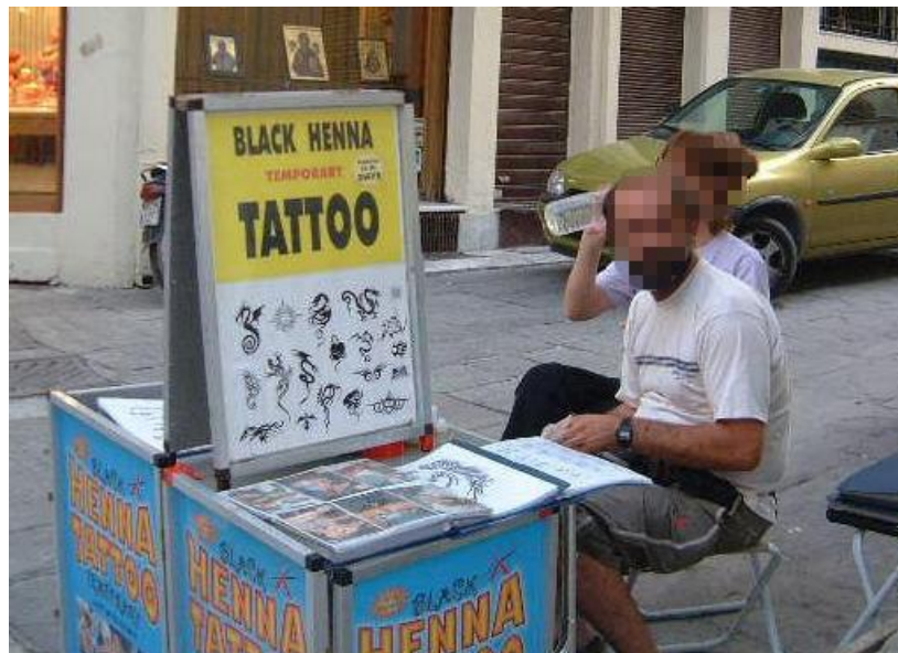
Figure 2: Street side artists attract clients with signs of “henna tattoos”

(Cartwright-Jones collection, Greece, 2003)