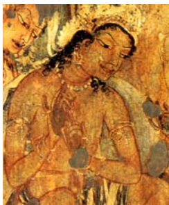
Figure 7: King Mahajanaka, Ajanta Caves, Maharashtra India, 5th – 6th century CE