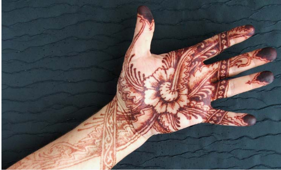
Figure 1: Henna body art: stain on skin (Cartwright-Jones, 2005)

“I didn’t know white people did henna!” (Indian-American girl observing Catherine