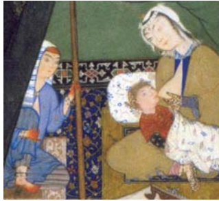
Figure 11: Detail from Life in The Country: The Nomad Encampment of Layla's Tribe, Tabriz, 1539 – 43, Cambridge, Harvard University Art Museum 1958.75