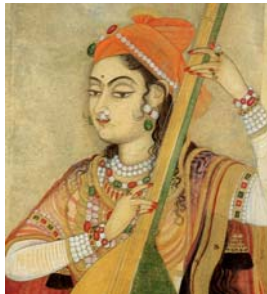
Figure 6: A Lady Playing the Tanpura, Rajasthan, Kishangarh, ca. 1735, Metropolitan Museum of Art, New York, Fletcher Fund, 1996 (1996,100.1) Indian Court Painting, 16th – 19th C