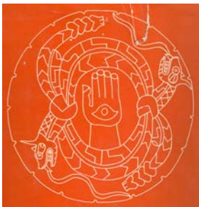
Figure 10: Ceremonial object, carved stone circle, Figure III from Waring and Holder, 1945 (Fundaberk, 1957: 53)