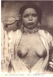
Figure 8: Postcard 185: Scenes Et Type, Fez, Beuté Morocaine, H. D. Séréro, Fez, Mailed 1909