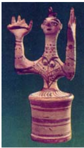
Figure 12: Figure from the Little Palace, Knossos Post-Palace Period, 1400 – 1100 BCE Gallery X, Case 140, Figure 46, Herakleion Museum, Greece