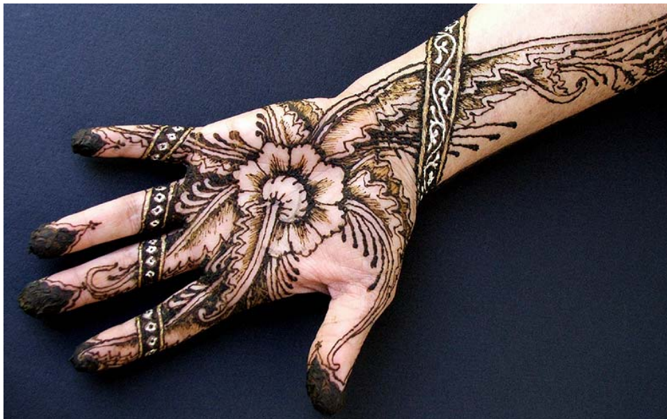
Figure 4: Henna body art, paste on skin (Cartwright-Jones, 2005)

To construct a systematic study of henna, it must be identified and understood as a plant, as a material culture including its cosmetic, medicinal, and ritual traditions, and all aspects must be situated in geographies and history. To this end, henna and its uses must be precisely identified.