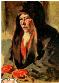
Figure 9: Post card, purchased from an Ebay auction, labeled “Arab woman”