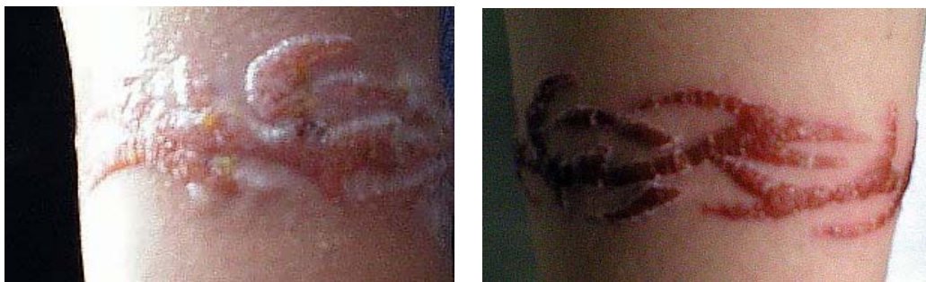
Figure 3: Blistering and scarring from para-phenylenediamine applied to skin, sold as a “black henna tattoo” in Rome, Italy (Willett, 2005)

artists substituted para-phenylenediamine for henna, marketing it as “black henna”. Inevitably, a purchaser developed injuries similar to Figure 3, and sued the city of Santa Monica. The city subsequently banned henna body art. The city may have been unaware that para-phenylenediamine, not henna, was the causative factor in injury, or it may have been unwilling to police artists’ mixes for the chemical (White & White, 2001). This sequence has been repeated in many countries.