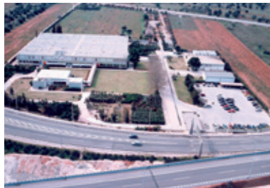
Koropi / Greece Solid forms. Supply of European, Asian, African and Australian markets.