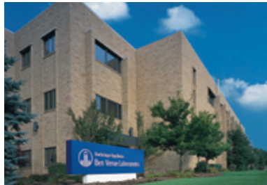
Bedford, Ohio / USA Liquid and lyophilized sterile products. Globally approved by multiple regulatory agencies.