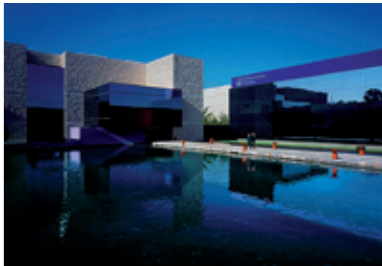
Mexico City / Mexico Solid, non-sterile liquid and semi-solid forms. Supply of solid forms for NAFTA market. FDA approved.