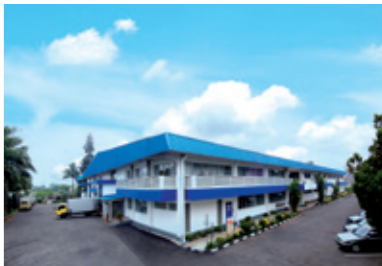
Bogor / Indonesia Solid, oral liquid and semi-solid forms. Supply of Asian markets. ASEAN approved.