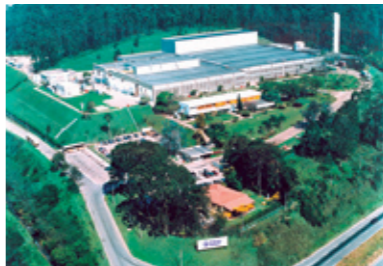
Itapecerica / Brazil Solid and non-sterile liquid forms. Supply of Latin American and European markets. ANVISA, ANMAT, INVIMA and EMEA approved.