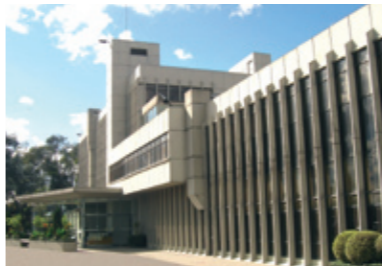
Bogota / Colombia Non-sterile liquid, solid, semi-solid forms and quality services for Latin American markets.