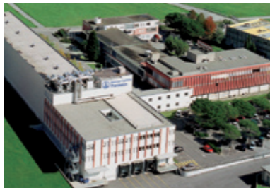
Lugano / Switzerland Solid and oral liquid forms. Expertise in phytopharmaceuticals.