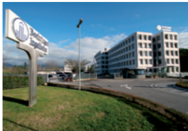
Reggello / Italy Semi-solid, solid and non-sterile liquid forms.